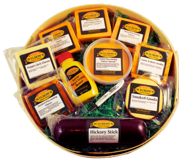
Gift Box #11 .....$74.99 3-8oz Pinconning cheeses, 2-8oz flavored Cheeses, 1-8oz Cheese Spread, 1-8oz Smoked Pinconning Cheese, 1-8oz Smoked Gouda, 1-1lb Hickory Stick, 1-10oz Wilson's Mustard, 1-Sharp Knife