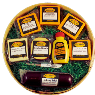
Gift Box #10 .....$59.99 3-8oz Pinconning Cheese, 2-8oz Flavored Cheeses, 1-8oz Smoked Gouda, 1-1lb Hickory Stick, 1-10oz Wilson's Mustard, 1-Sharp Knife