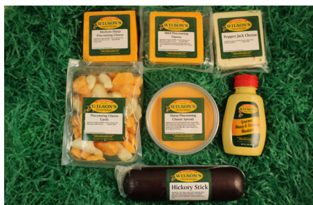
Gift Box #8 .....$49.99 2-8oz Pinconning Cheese, 1-8oz Flavored Cheese, 1-8oz Cheese Spread, 1-1lb Hickory Stick, 1-10oz Wilson's Mustard, 1-11oz Cheese Curd