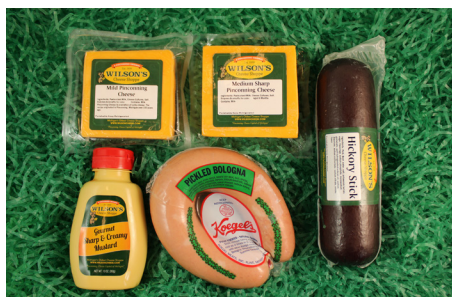
Gift Box #5 .....$38.99 2-8oz Pinconning Cheeses, 1-1lb Hickory Stick, 1-Ring Pickled Bologna, 1-10oz Wilson's Mustard