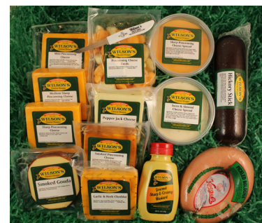
Gift Box #12 .....$89.99 3-8oz Pinconning Cheeses, 2-8oz Flavored Cheeses, 1-8oz Smoked Pinconning Cheese, 1-8oz Smoked Gouda, 2-8oz Cheese Spreads, 1-1lb Hickory Stick, 1-Ring Pickled Bologna, 1-10oz Wilson's Mustard, 1-11oz Cheese Curds, 1-Sharp Knife