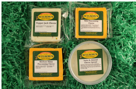
Gift Box #1 .....$24.99 2-8oz Pinconning Cheeses, 1-8oz Flavored Cheese, 1-8oz Cheese Spread