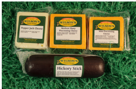
Gift Box #2 .....$28.99 2-8oz Pinconning Cheeses, 1-8oz Flavored Cheese, 1-1lb Hickory Stick