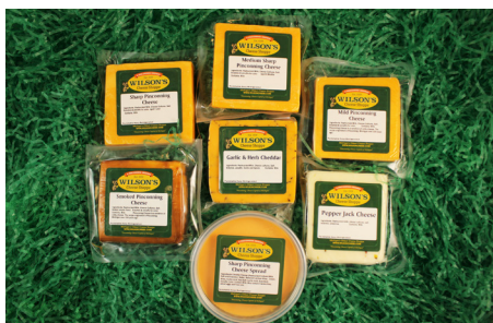
Gift Box #7 .....$42.99 3-8oz Pinconning Cheese, 1-8oz Smoked Pinconning Cheese, 2-8oz Flavored Cheese, 1-8oz Cheese Spread