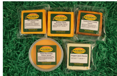
Gift Box #3 .....$30.99 2-8oz Pinconning Cheeses, 1-8oz Smoked Pinconning Cheese, 1-8oz Flavored Cheese, 1-8oz Cheese Spread