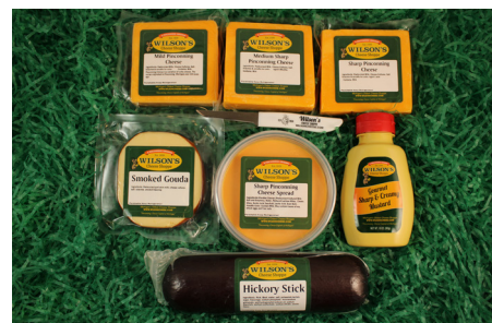
Gift Box #9 .....$54.99 3-8oz Pinconning Cheese, 1-8oz Cheese Spread, 1-8oz Smoked Gouda, 1-1lb Hickory Stick, 1-10oz Wilson's Mustard, 1-Sharp Knife