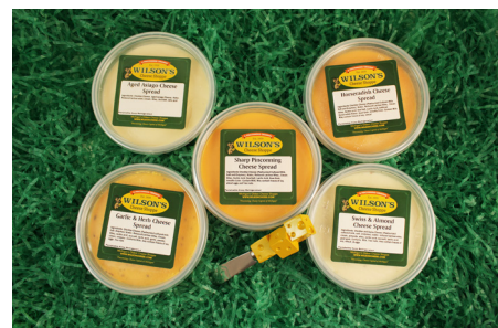
Gift Box #6 .....$35.99 5-8oz Cheese Spreads, 1-Cheese Spread Knife