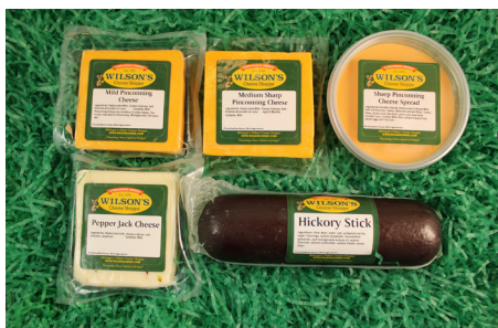
Gift Box #4 .....$35.99 2-8oz Pinconning Cheeses, 1-8oz Flavored Cheese, 1-8oz Cheese Spread, 1-1lb Hickory Stick